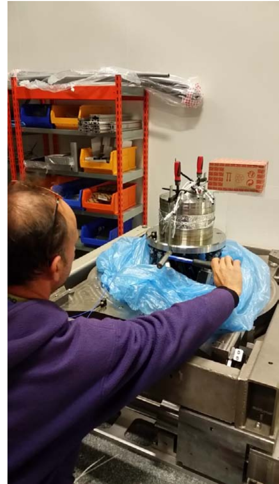
Excitation along X